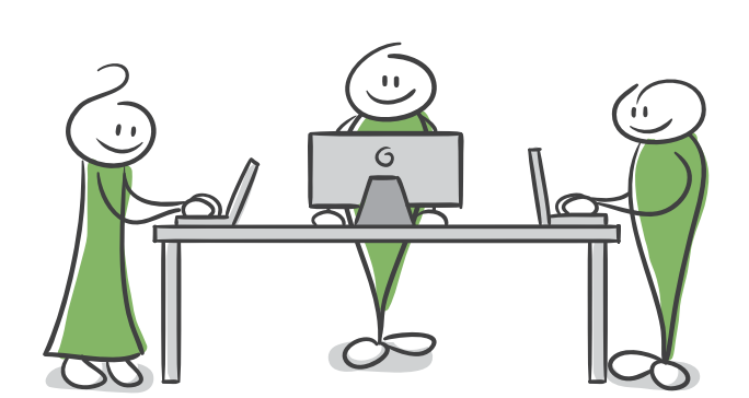
Try to keep computers in common spaces of your house